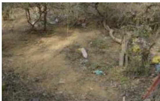
Gahvarvan before restoration