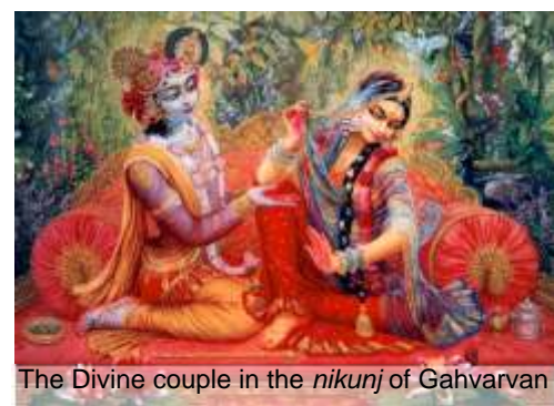
The Divine couple in the nikunj of Gahvarvan