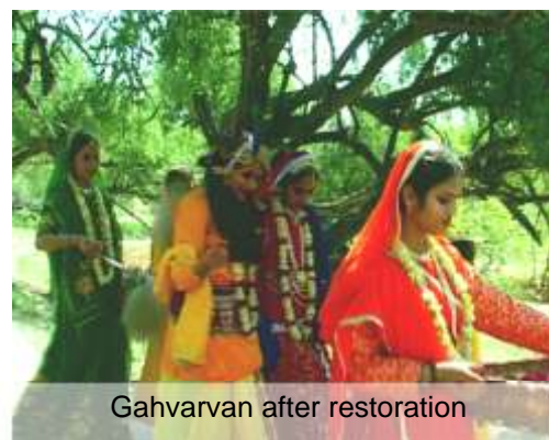
Gahvarvan after restoration