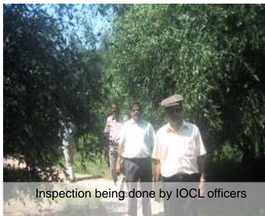
Inspection being done by IOCL officers