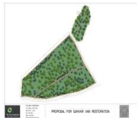
Gahvarvan restoration plan