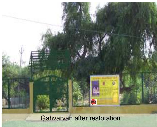
Gahvarvan after restoration

Such a wonderful grove, which finds mention in the scriptures, was neglected for decades. The villagers had encroached upon most of its