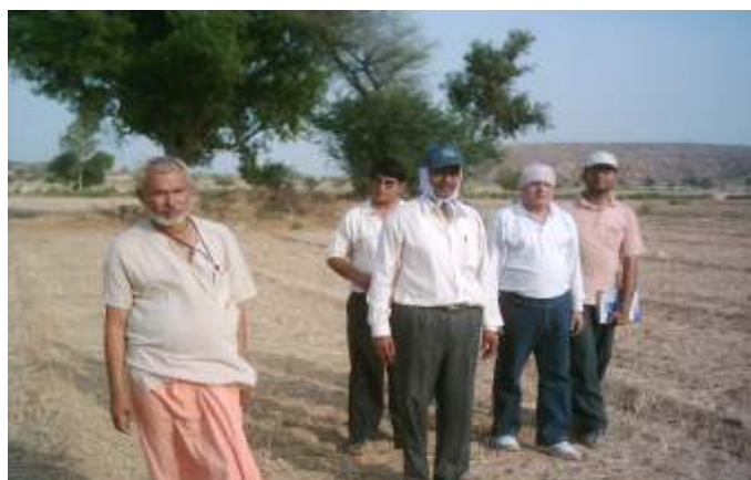
BAIF officials with TBF representatives doing the survey