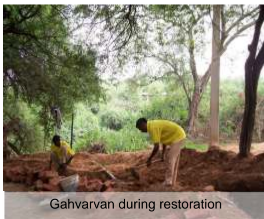
Gahvarvan during restoration