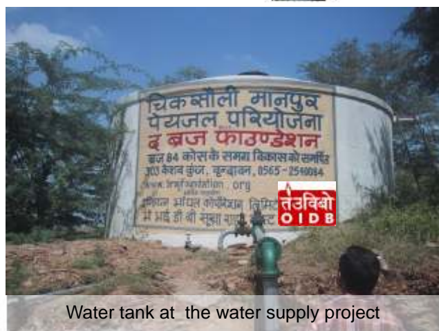
Water tank at the water supply project